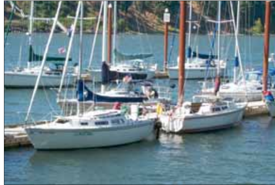
Sand Island, St. Helens